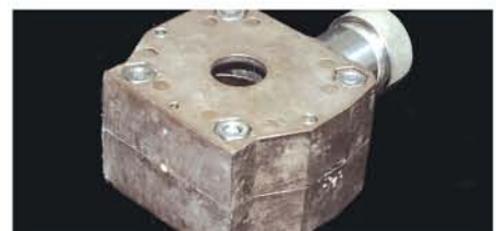
Figure 8 Bolted injection flask necessitating capping pour made through a hole in top. Since you cannot see inside the flask, it is very critical that the pour be smooth, flowing, and bubble free to provide a complete and accurate fill.