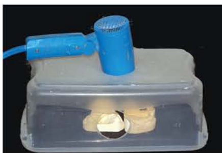
Figure 5 A simple drying box constructed from a dollar store box and a hair dryer shortens the drying time of models and the coatings of Wondergloss to 10-15 minutes. Holes cut on sides allow for air flow thru and also prevents thermal sensor from overheating on dryer.