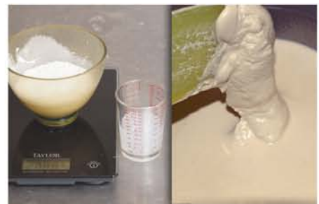
Figures 7 & 7b Measurements for an average model are 150gr of stone to 50ml of Wonderadmix. Consistency of stone when mixed for models or capping is smooth, creamy, and easy flowing. Slight vibration immediately causes it to flow.