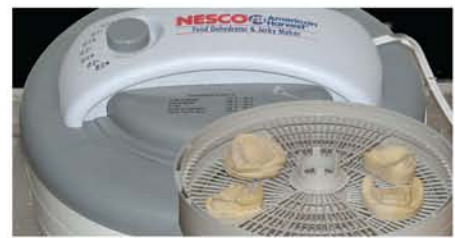
Figure 5b A food dehydrator is also an easy, economic way to speed up model and Wondergloss drying. It also comes in handy for drying separator coated denture flask molds.