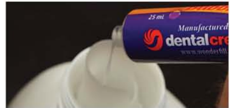
Figure 6 Wonderadmix is supplied in the syringe. The bottle is empty but holds the correct amount of water when filled for the correct ratio for the syringe amount. It also means the shipping charges do not reflect a gallon of liquid in weight but rather a syringe and an empty bottle. Shake well each time before measuring out liquid to make a model.