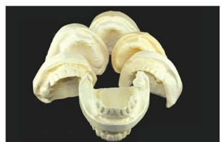
Figure 9 The value projection for every case starts with boxed, smooth, clean, accurate models. It doesn't take a fortune in products, just the correct products.