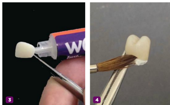
Fig 2. Wonderpeg Instant Firing Support. Fig 3. Wonderpeg is dispensed straight from the syringe, and the restoration and peg are placed on the firing tray. Fig 4. The inner edge of the restoration is cleaned before firing glaze to prevent the wet porcelain from firing to the refractory material.