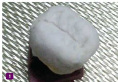
Fig 1. Leaving the bite opening of the wet porcelain buildup open ½ mm in the anterior before carving in the basic anatomy when using Stax Plus.

Finally, the author acquired Wonderpeg Instant Firing Support from